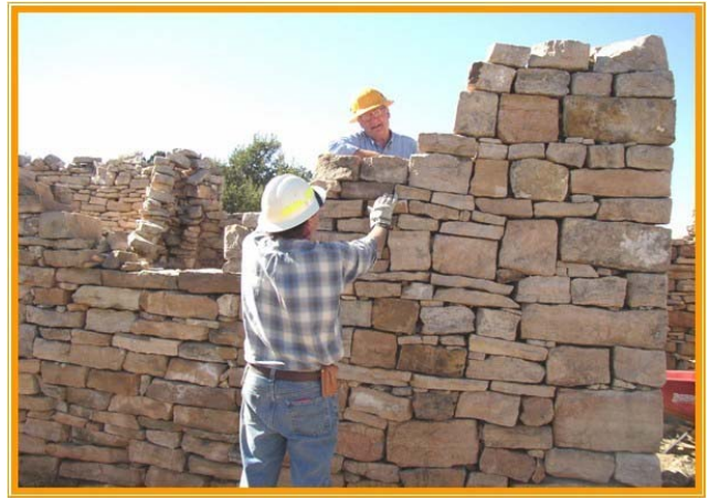
P.I.T. Volunteers working at the Hacienda Site

The Anton Chico Hacienda Site is one of the best-known historic sites in the area. It is the only large ranching agricultural site of its type on the Forest. The Hacienda Site has been the subject of several annual Passport In Time projects focusing on stabilization of the walls. All of the Anton Chico historic sites are threatened and heavily vandalized by rock thieves. Other monitored sites in the Pecos area include the Glorieta Baldy Lookout, a number of hunting blinds, many other rock art panels and rock shelters.