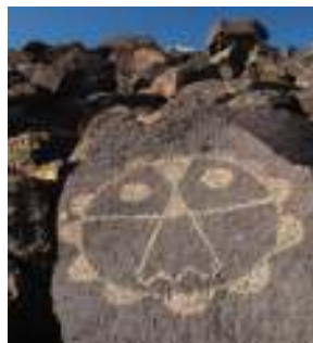
Above: Mask la Rinconada