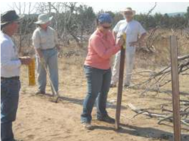
Garcia Signage Crew in Action: (L to R)