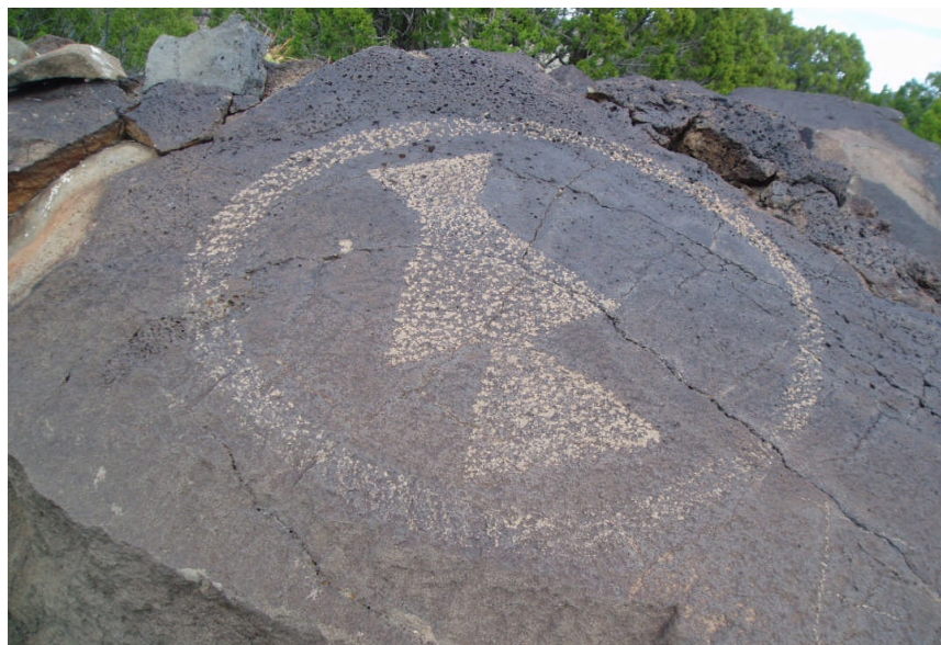
Mesa Prieta Pueblo Petroglyph

Tours are scheduled April 19, May 17, September 20 and October 18 from 9:30 to 11:30 a.m.