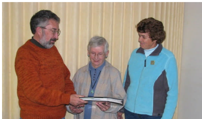
Passing the Torch:

So, happy stewarding. And don't forget to call in/call out.